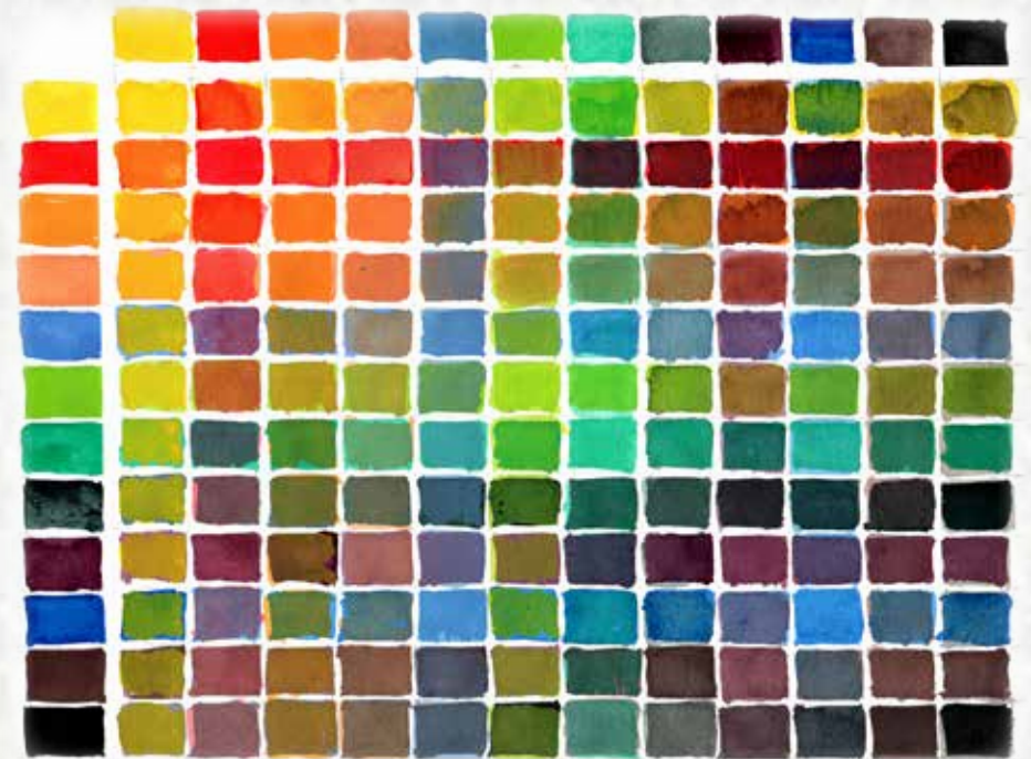
Colour chart created using 12 colours from the Inktense Paint Pan Set.

Across the top and down the left hand side of your chart place pure colours. Then see what can be created by layering one colour over the top of another.